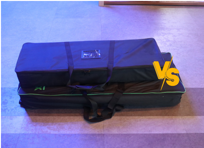
WhiteboxGo (Top) The same size unit with 30% less packaging.