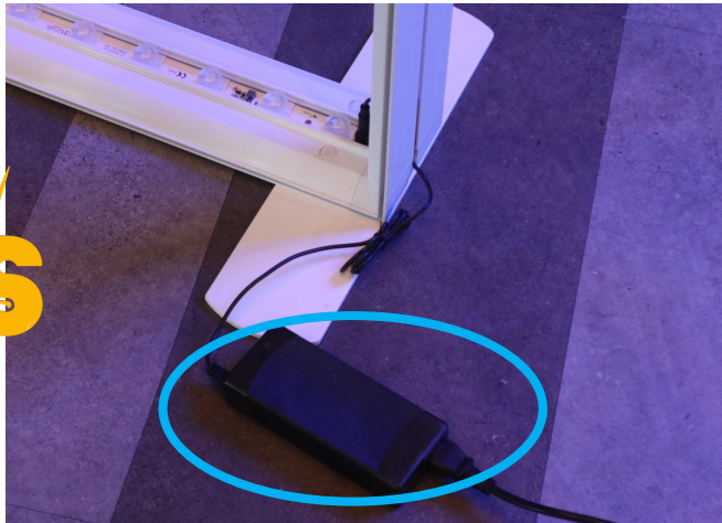
Competitor Bulky and untidy external transformer