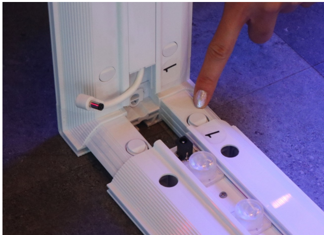
Internal wiring as well as built in right angle and straight connectors Vs loose connectors and wiring prone to loss or damage