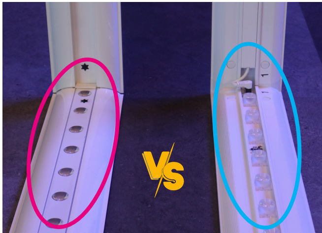
WhiteboxGo (Left) LEDs built safely inside the frame vs unprotected external LED prone to damage