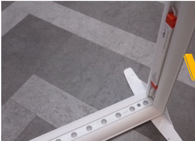
WhiteboxGo Unique hidden internal transformer