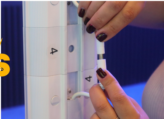
Competitor Brittle push click connectors and external wiring